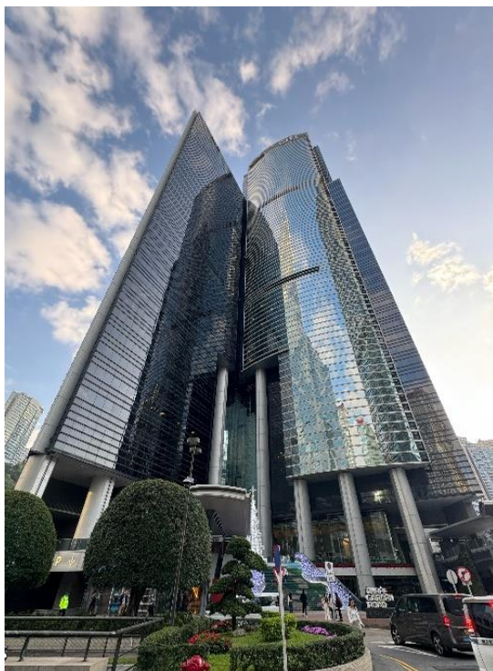
Three Garden Road

※Elevator modernization is the process of improving elevator performance by transforming old elevators into one equipped with the latest technology.