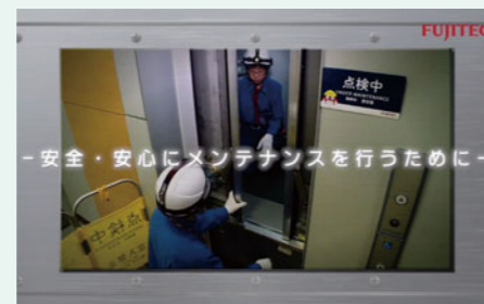
Safe operating procedure videos

To enhance safety awareness, the Safety Control HQ created videos covering safe operating procedures (an installation version and maintenance version). The videos target employees in the Installation Division and the Maintenance Division. In addition to reinforcing basic tasks, the videos comprehensively and clearly explain important safety procedures. Questions are posed at several points in the videos to confirm understanding. The videos are widely used for new employee training and other purposes.