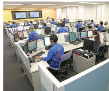
Safe Net Center