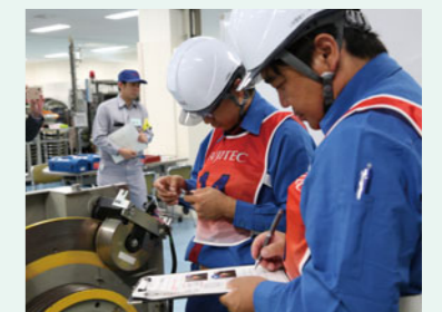
Ninth National Maintenance Technique Competition

Our field engineers are responsible for the installation, repair and improvement, and maintenance of our elevators and escalators. Every year, we hold a national technical skills competition that alternates between the themes of "installation/renovation" (National Installation/Renovation Technique Competition) and "maintenance" (National Maintenance Technique Competition), the two main tasks of field engineers. In addition to checking the skills of field engineers, the event provides an opportunity for technical exchanges among engineers and for improving individual skills.