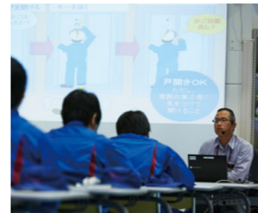
Safety awareness training