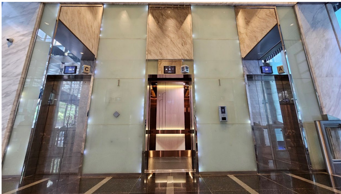
One Raffles Place Replaced Elevators

※Elevator modernization is the process of improving elevator performance by transforming an old elevator into one equipped with the latest technology.