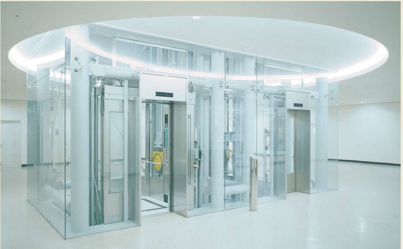
First World Hotel Genting Highland, Malaysia