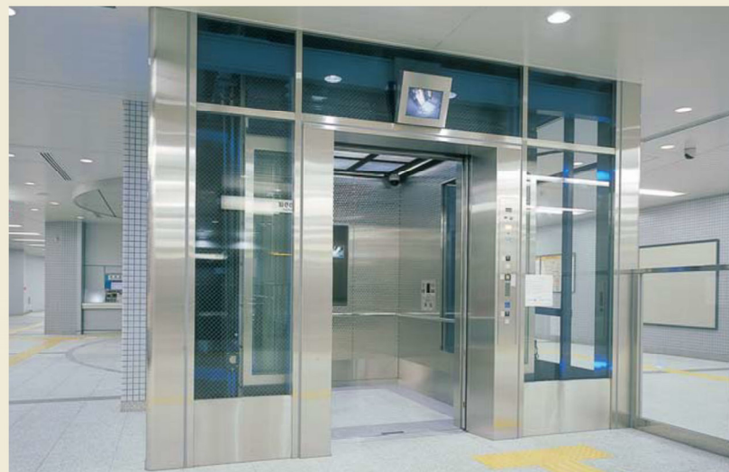
Calgary International Airport Calgary, Canada