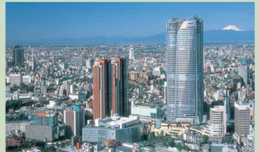
The Roppongi Hills (The Grand Hyatt Tokyo) Tokyo, Japan

⑭ Kagoshima Prefectural Office Building Kagoshima, Japan