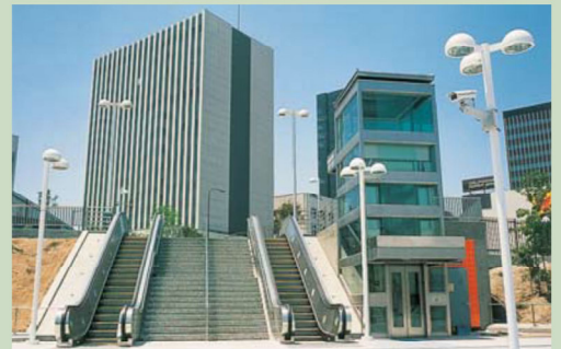
The Red Line Subway Los Angeles, U.S.A.