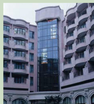
Shanghai Marriott Hotel Hongqiao Shanghai, China