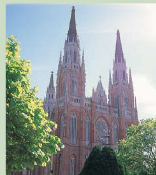
La Plata Cathedral Buenos Aires, Argentina