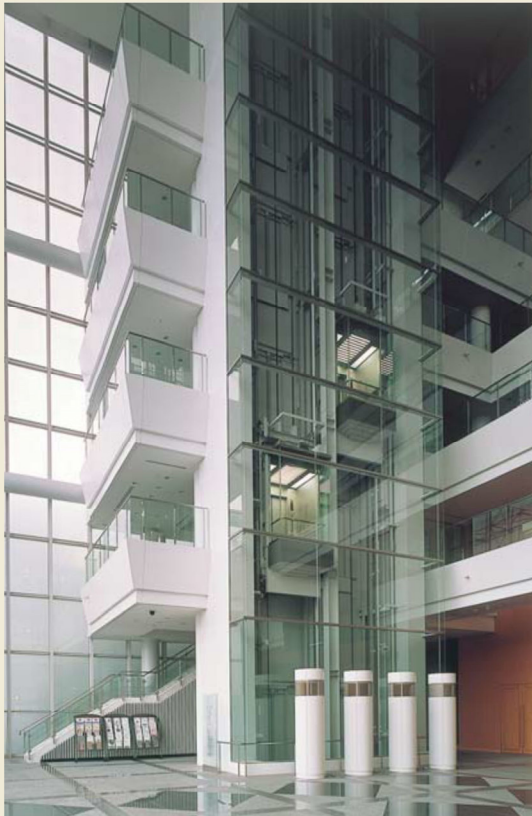
Hong Kong Central Library Hong Kong, China