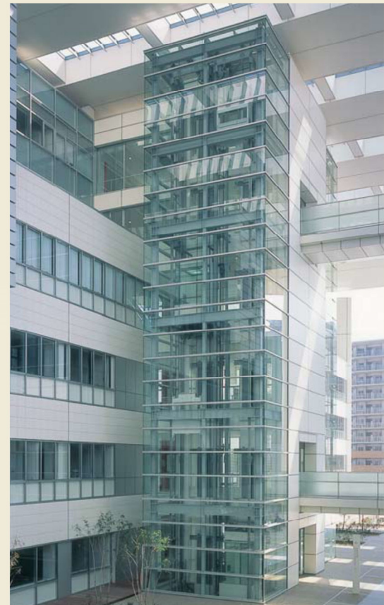
Kolon Tower Kwa Chon, Korea